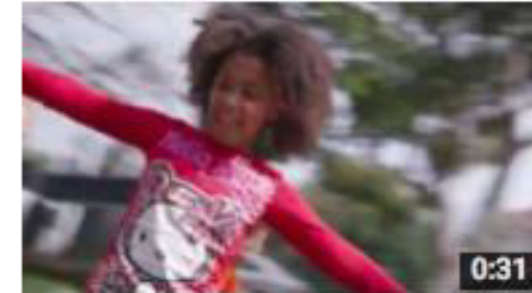
the #GlobalGoals for a..