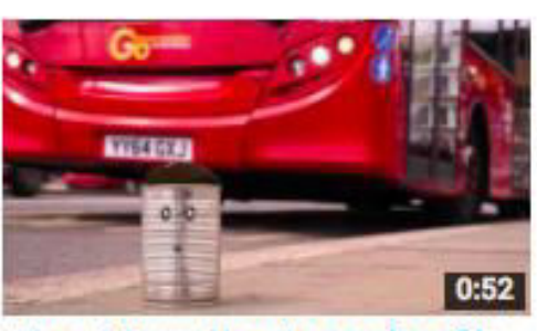
When I Grow Up- A recycling film by Unilever